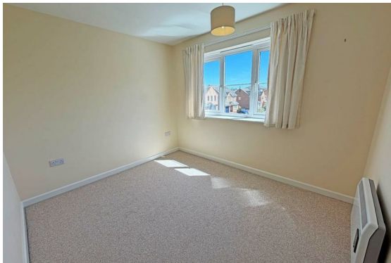
Lounge/Diner 18'1" max x 12'4" (5.52m max x 3.76m)